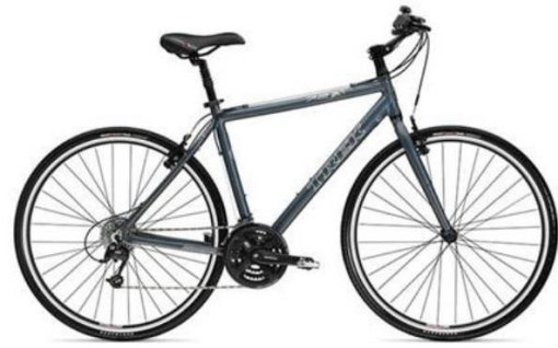
Trek Bike 7.2 FX