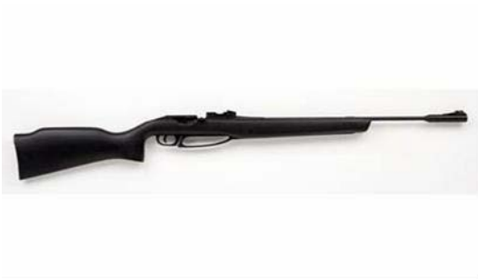
Daisy Match Grade Avanti 753S