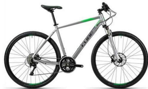
Hybrid Cross Trainer