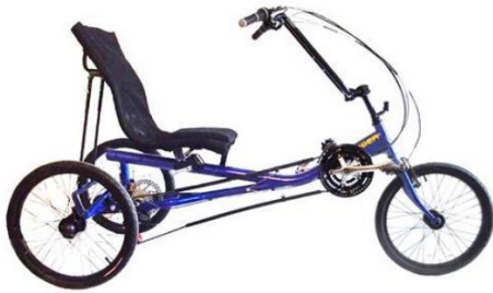
Recumbent Bike Popular Brands: Catrike, Sun products